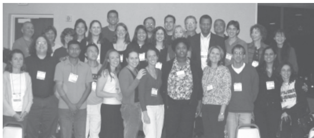
2005 Project ACCESS Fellows